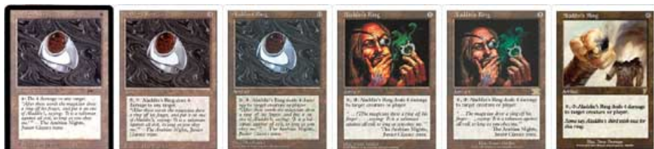
Aladdin's Ring was reprinted in Revised , Fourth , Fifth , Sixth , and Seventh Editions, and has been confirmed for next year's Eighth Edition.