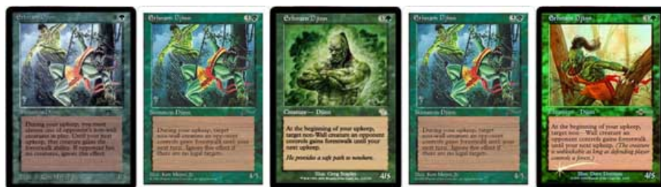
Erhnam Djinn was reprinted in Chronicles and Judgment , as well as the Anthologies and Beatdown box sets.

I don't need to tell you much about Erhnam Djinn , since it has resurfaced in Judgment . Ask any long-time pro, and he or she will regale you with stories of Erhnam Djinn followed by Armageddon followed by the bellowing laughter of victory. Ask any long-time casual player, and I bet you'll also hear stories of the Erhnam Djinn deck that used no forests, thereby negating its "drawback" (but come on, people, it's a 4/5 for four mana . . . you really want to spend your time blocking?).