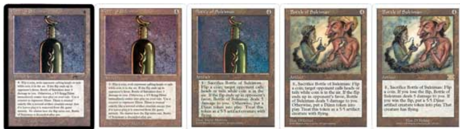
Bottle of Suleiman was reprinted in Revised, Fourth, Fifth, and Sixth Editions.

Ah, yes. Most of you just blinked and spit coffee onto your monitors. Bottle of Suleiman! !?