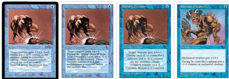
Unstable Mutation was reprinted in Revised, Fourth, and Fifth Editions.

I am attracted to blue beatdown decks in the same way that I'm attracted to green control decks. Blue's style doesn't naturally lend itself to aggressive beatdown; the exceptions in recent memory are tournament decks like "Blue Skies" and Merfolk decks, both of which employ a fair amount of countermagic as a support strategy. Because the very idea of blue beatdown seems counterintuitive, I like thinking of ways to make it work.