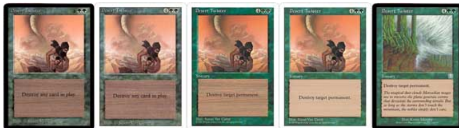
Desert Twister was reprinted in Revised, Fourth, and Fifth Editions, and then again in Mercadian Masques.

Compare Desert Twister to Vindicate and you may be tempted to feel sorry for green. Remember, though, that not only does green have the biggest creatures in the land, but it also can most easily accelerate its mana development. Sure, Desert Twister is expensive, but the payoff—the ability to destroy any permanent—is sweet. Having Desert Twister in my deck gives me that comfortable, warm feeling that I have an answer to most of my opponent's threats.